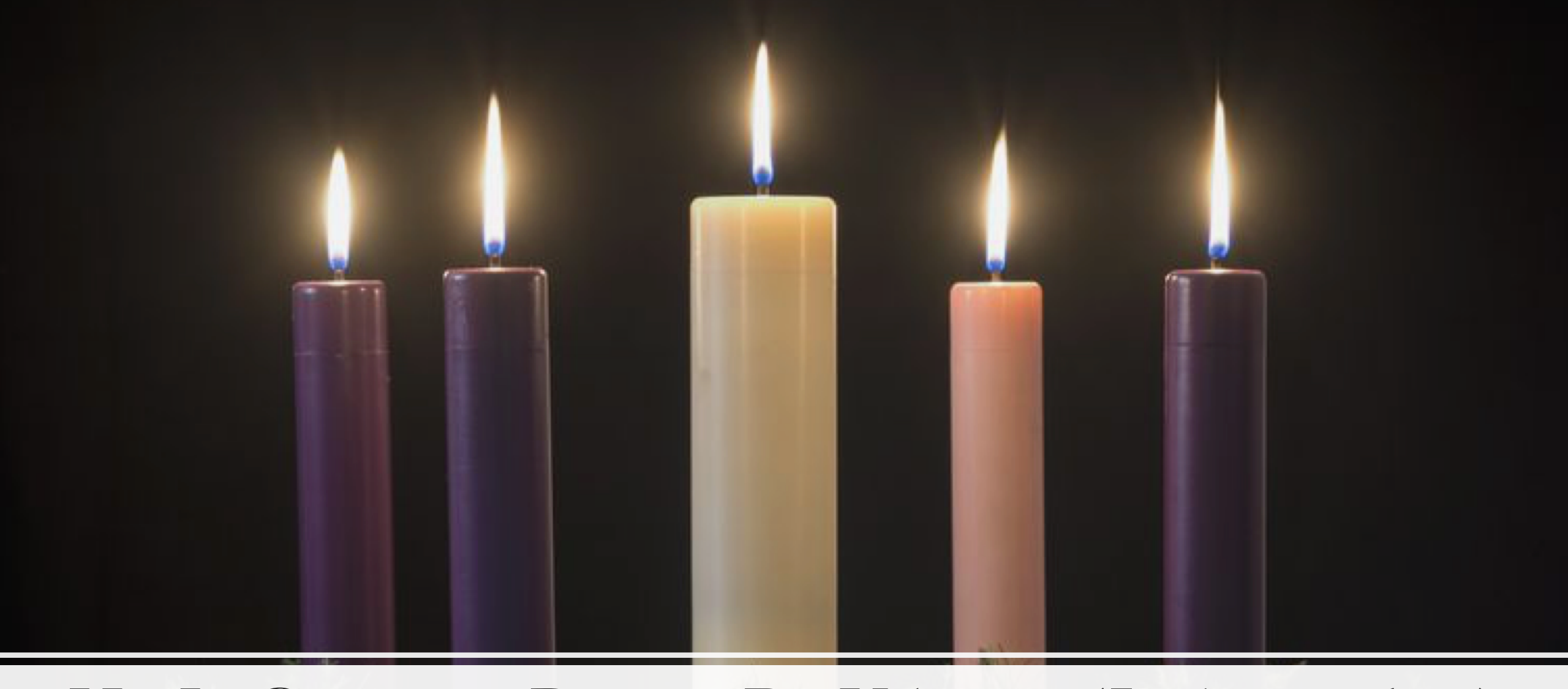
He Is Coming, Part 3: Be Vibrant (Luke 1:46-55)